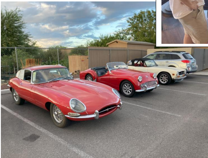
Northwest side drive. From Starbucks to Beyond Bread, with a lot of Marana in between.