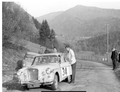
A Rallying Wolseley