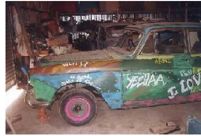
This is the end of the Line for many a Wolseley 6/99 – Demolition Derby Fodder